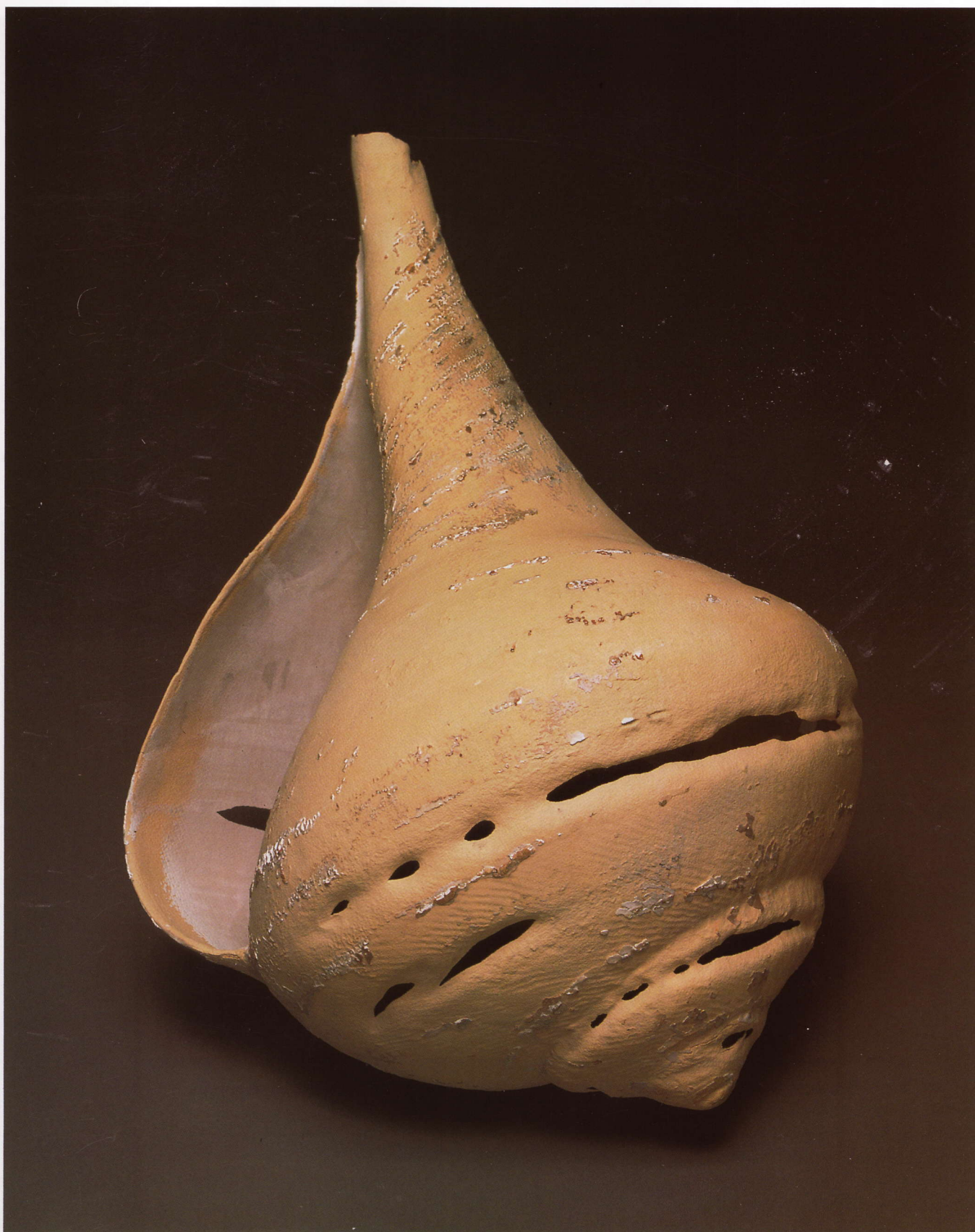
"All that Remains," 19 in. (48 cm) in height, coil-built paper clay, fired to Cone 6 in an electric kiln, with glaze and terra sigillata, then salt fired to Cone 06 and sandblasted.