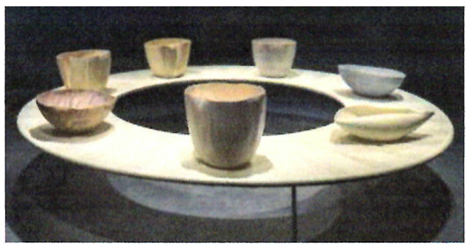
Paula Murray: You Are Me 2016. Circle Diameter is 11”. Aluminium structure wrapped in muslin.

Each bowl begins with a pure and unblemished skin but over multiple kiln firings, Murray employs a variety of techniques of infilling, knitting, sandblasting and burnishing to either enhance or diminish the ruptures. The patina that Murray creates in these open, closed, vertical and horizontal receptacles conveys a uniqueness seemingly attained over a passage of time. Look inside and outside each vessel: the smooth and rough textures, the fractures, the ripples, and the wrinkles connote pulsating veins, muscles, flaws, and defects. The bowls nestle in a ring on a wrapped tubular metal armature. Together as a group they form a wondrous and harmonious collection while maintaining their individuality to reveal both strength and tranquillity. The message is at once ambiguous and clear: we are all the same yet different, you are me, and I am you.